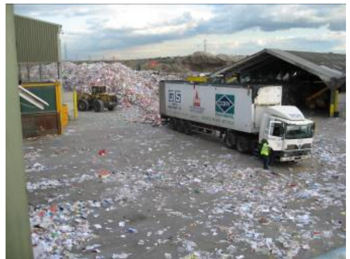
Dry recyclables being tipped

There is the potential for the PET and HDPE to be reprocessed locally into higher value, recycled products, thus, providing closed loop solutions for priority recyclable materials. Grosvenor extracts 2,500 tonnes of plastic bottles each year. The fractions of plastic are currently baled for shipment to various markets where the grades are separated and remanufactured into such products as land drainage piping (HDPE), fleeces and car upholstery (PET).